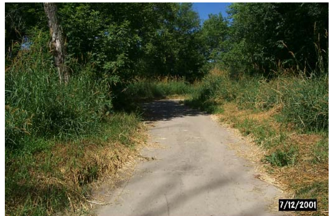
Fig. 4 - The State Trail from Harmony to Preston is paved and almost level.