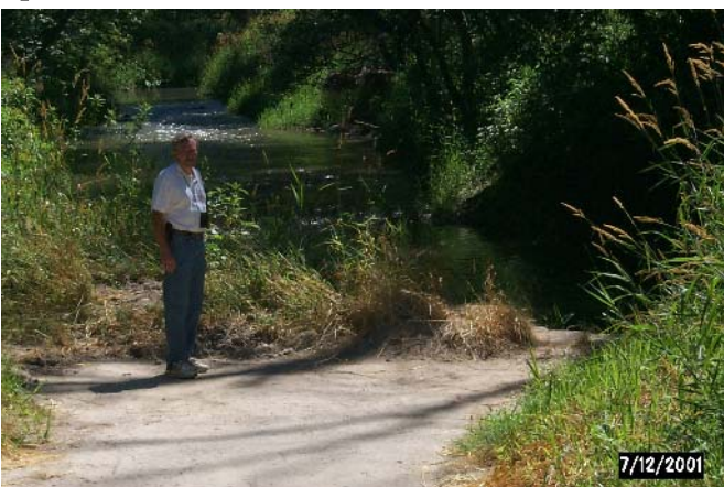
Fig. 3 - Camp Creek has had considerable habitat improvement work conducted on it.