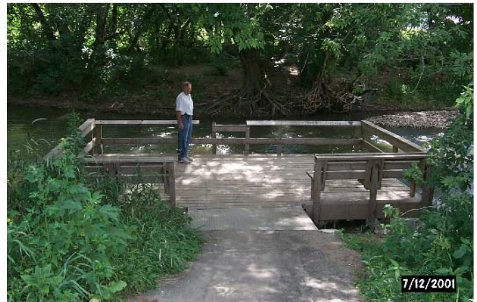
Fig. 2 - The approach to the pier is paved, but drops 5 -6 feet in 30 feet.