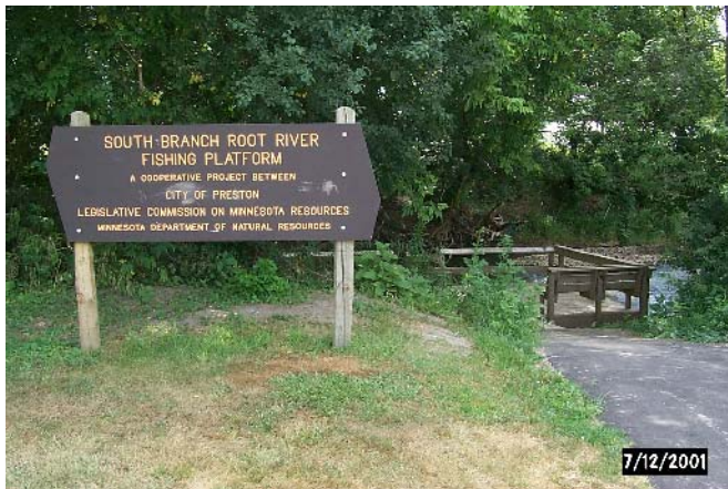
Fig. 1 - Cooperatively established pier is a shady spot on the South Branch Root River.

There is a fishing pier along the South Branch Root River located in the City of Preston (Fig. 1 & 2), and it can be accessed from the north end of the Trail Head parking lot. Three platforms located southeast of Preston along the Harmony-Preston Valley State Trail (Fig. 3), are along the lower first mile of Camp Creek and are accessed from the paved state trail off County RD 12.