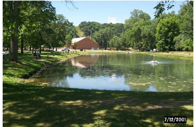
Fig. 4 - These ponds are located in Sylvan Park.