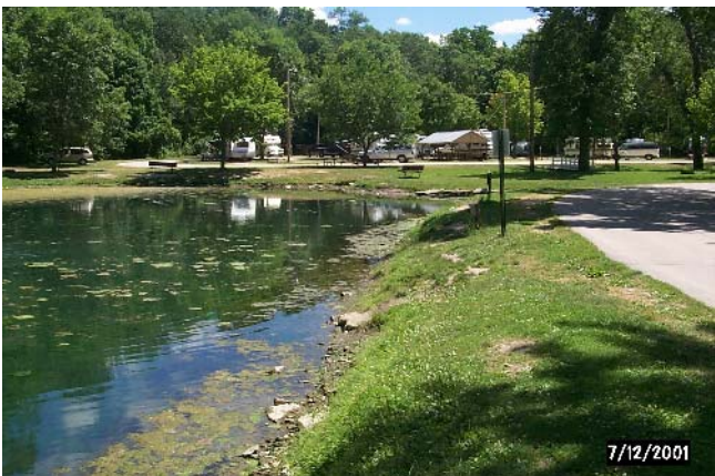
Fig. 3 - Some sites offer a pull out on compact dirt, and some shade part of the day. Ponds are stocked with rainbow trout at various times throughout the year.