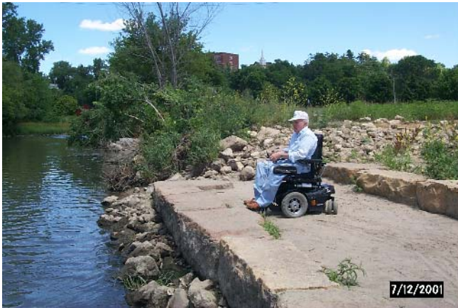
Fig. 3 - The approach is cement at a very slight angle.

There are several accessible sites along South Branch of the Root River in Lanesboro at the face of the dam (Fig. 1 & 2). The City Park in Lanesboro also offers accessible fishing for rainbow trout on 2 ponds (Fig. 3 & 4). Both offer good parking and easy access.