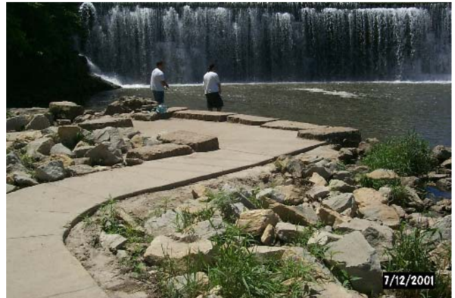
Fig. 2 - Fishing is on a large pool.